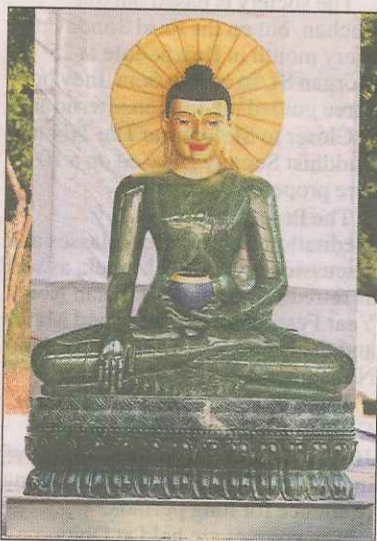
Buddha buzz: this Buddha monument will find a home at Bendigo.

It will be completed once enough donations have been received.